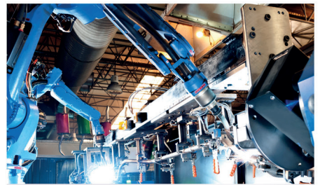
INDUSTRIAL MACHINERY & MAINTENANCE