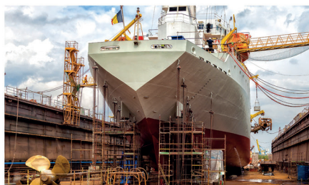
SHIPBUILDING & MARINE