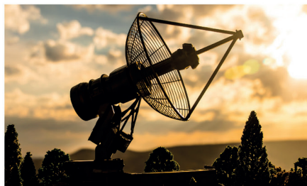
MILITARY & DEFENCE